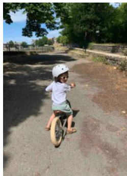
Riding to the AGM

We hope you have a great month and that we'll see you at 6pm on Sunday 4th December for the Annual General Meeting. Until then, have a great November, send us your news and tell us what you want to see in your newsletter.